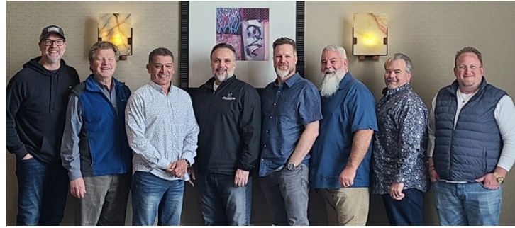
Elected and appointed (by due process of IMA) representatives of our IMA ministerial fellowship.