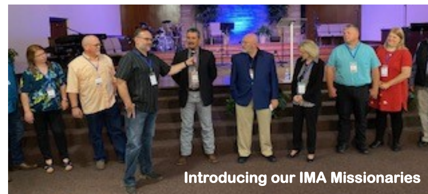
Introducing our IMA Missionaries